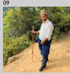
09 Hiking Stick at Tiger Nest 虎穴寺的登山杖