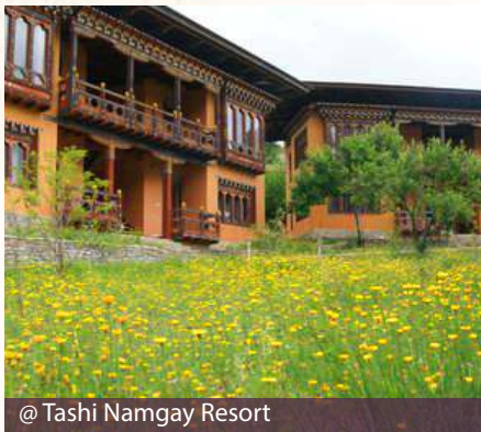
@ Tashi Namgay Resort