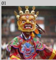
01 Bhutanese Cultural Dance 不丹文化舞蹈表演