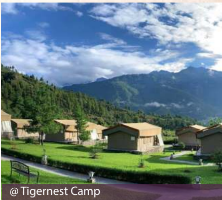
@ Tigernest Camp