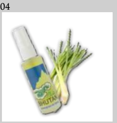
04 Organic Lemongrass Spray 天然香茅精油