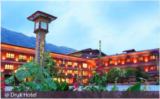
@ Druk Hotel