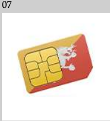
07 Local Data Sim Card 3GB 3GB网络电话卡