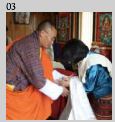
03 Bhutanese Tashi Khadar 不丹传统围巾