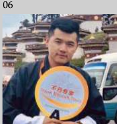
06 English, Chinese Speaking Guide 中英导游讲解