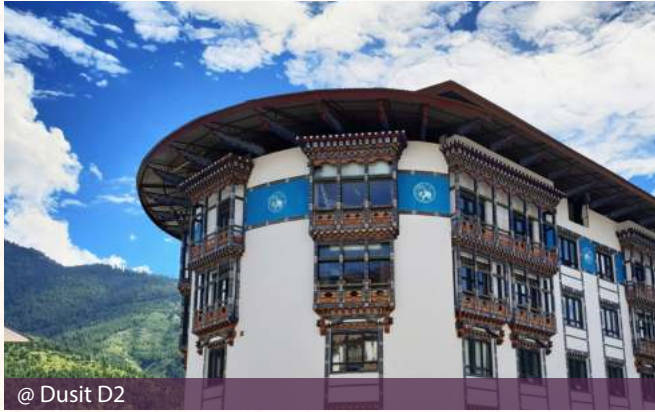
@ Dusit D2