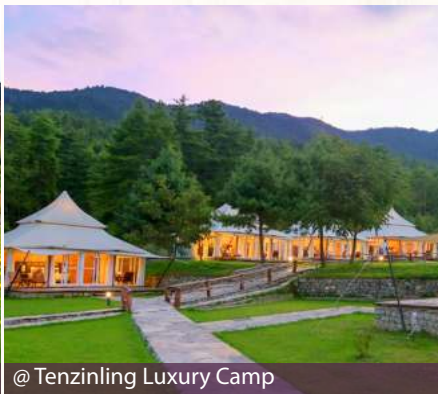
@ Tenzinling Luxury Camp