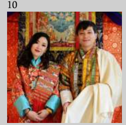
10 Bhutanese Costume Experience 不丹传统服装