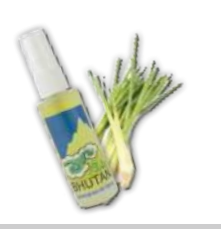
Organic Lemongrass Spray 天然香茅精油