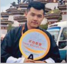
English, Chinese Speaking Guide 中英导游讲解