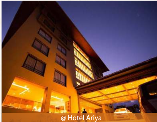
@ Hotel Ariya