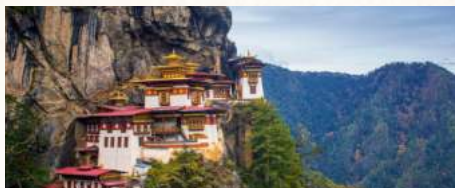
PARO, Tiger Nest