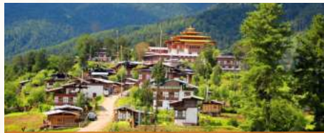
GANGTEY, Gangtey Valley