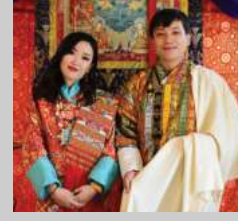
Bhutanese Costume Experience 不丹传统服装