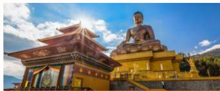
THIMPHU, Buddha Point