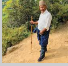
Hiking Stick at Tiger Nest 虎穴寺的登山杖