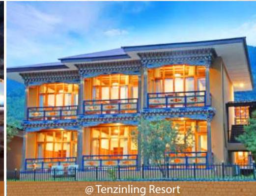
@ Tenzinling Resort