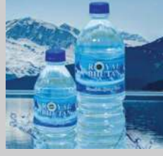
Unlimited Complimentary Water 无限矿泉水