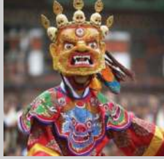
Bhutanese Cultural Dance 不丹文化舞蹈表演