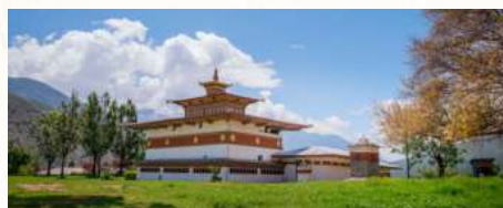
WANGDUE PHODRANG, Chimi Lhakhang