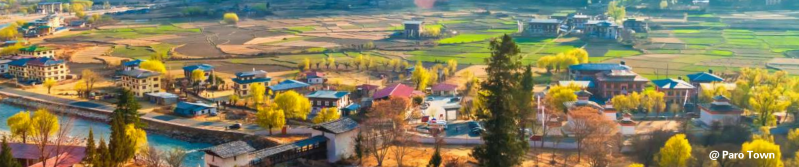
@ Paro Town