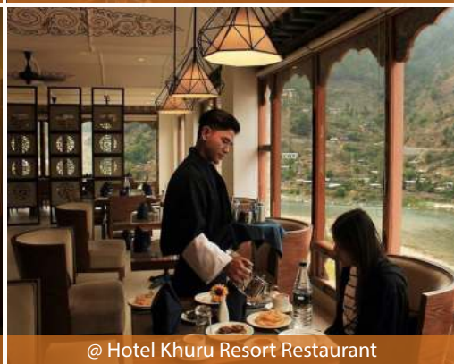
@ Hotel Khuru Resort Restaurant