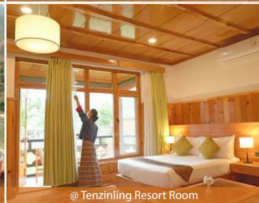
@ Tenzinling Resort Room