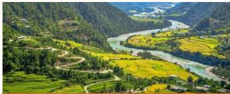
PARO, Paro valley