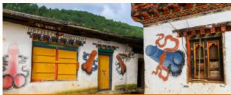
PUNAKHA, Phallus Paintings