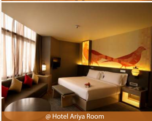
@ Hotel Ariya Room