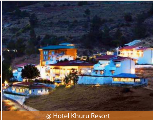
@ Hotel Khuru Resort