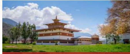
WANGDUE PHODRANG, Chimi Lhakhang