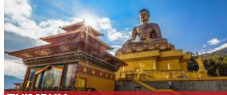
THIMPHU, Buddha Point