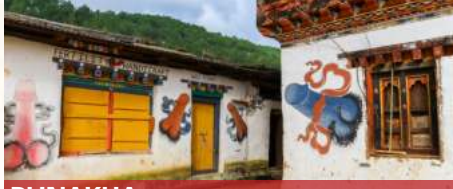
PUNAKHA, Phallus Paintings