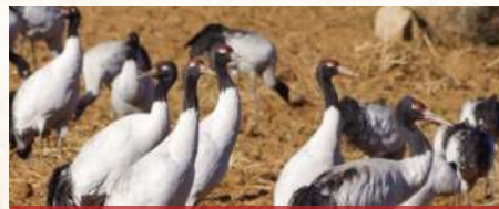
GANGTEY, Black-Necked Cranes