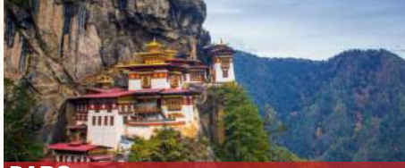
PARO, Tiger Nest