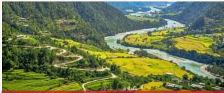
PARO, Paro valley