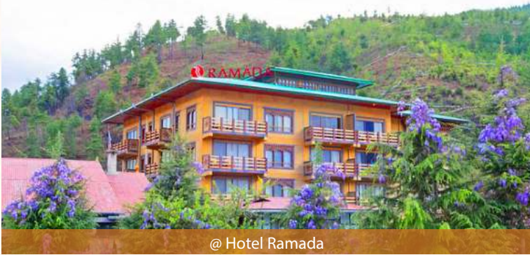
@ Hotel Ramada