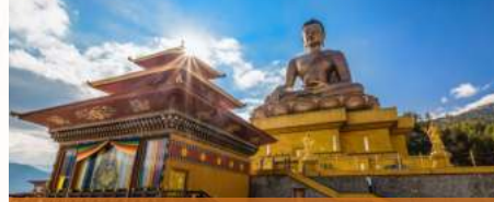
THIMPHU, Buddha Point