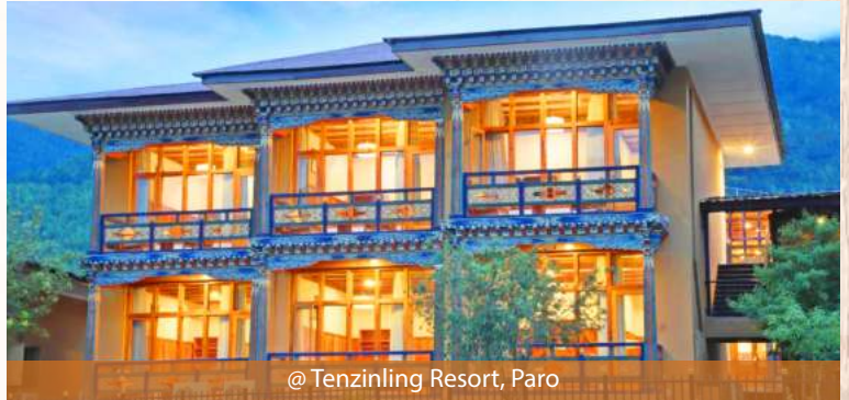
@ Tenzinling Resort, Paro