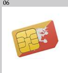
06 Local Data Sim Card 3GB 3GB网络电话卡