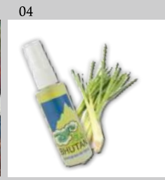
04 Organic Lemongrass Spray 天然香茅精油