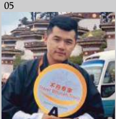
05 English, Chinese Speaking Guide 中英导游讲解