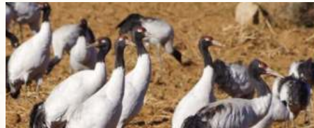
GANGTEY, Black-Necked Cranes