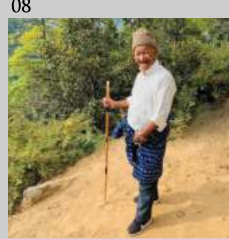
08 Hiking Stick at Tiger Nest 虎穴寺的登山杖