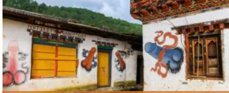
PUNAKHA, Phallus Paintings