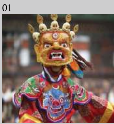
01 Bhutanese Cultural Dance 不丹文化舞蹈表演