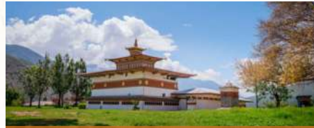
WANGDUE PHODRANG, Chimi Lhakhang