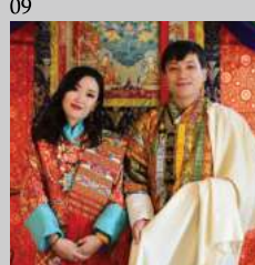
09 Bhutanese Costume Experience 不丹传统服装