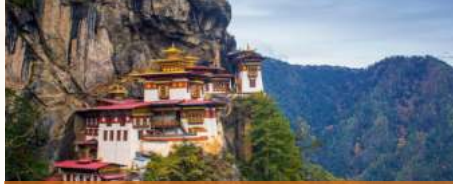
PARO, Tiger Nest