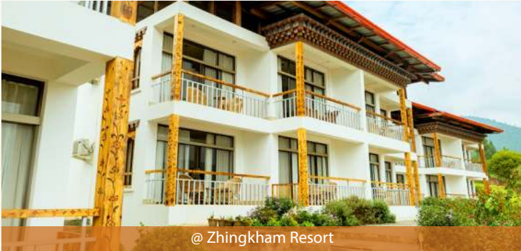
@ Zhingkham Resort