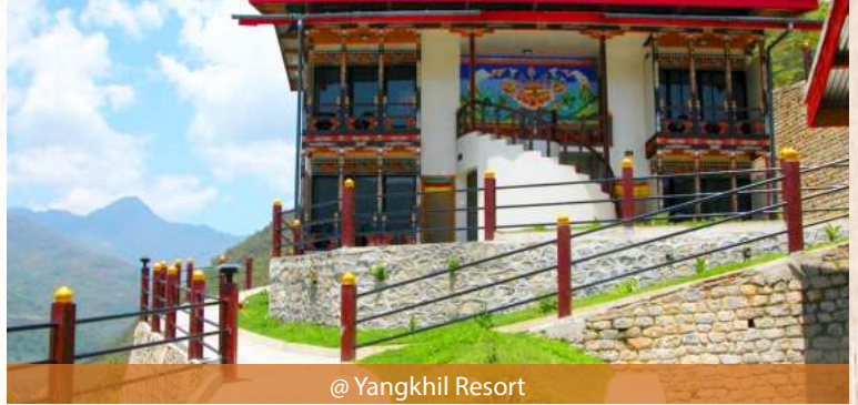
@ Yangkhil Resort