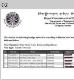
02 Bhutan Tourist Visa 不丹旅行签证